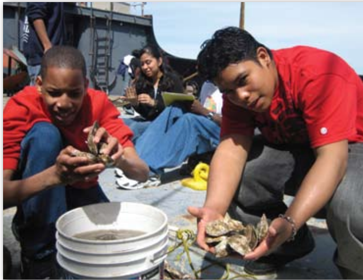
Urban Assembly NY Harbor School

Stewardship and education: the estuary offers countless opportunities for learning and enjoying outdoor activities. HEP supports efforts that encourage residents young and old to experience the waterfront.